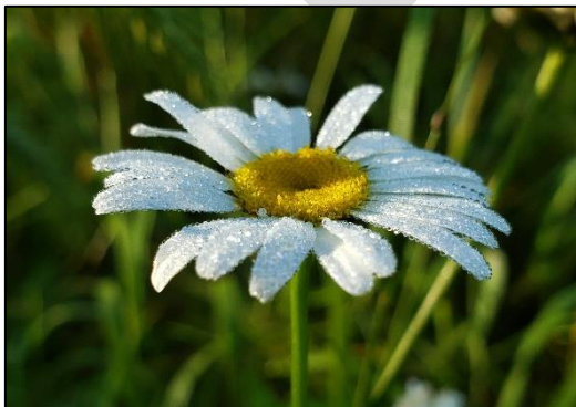
Jen Corman; 2022 Photo Contest: Plants & Scenery