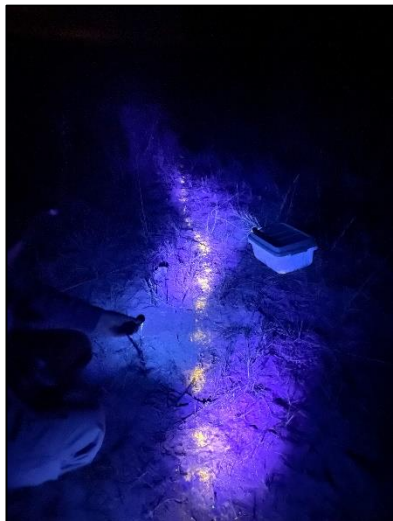
Phoebe Dunbar; 2022 Photo Contest: Wildlife Profession from Student Perspective