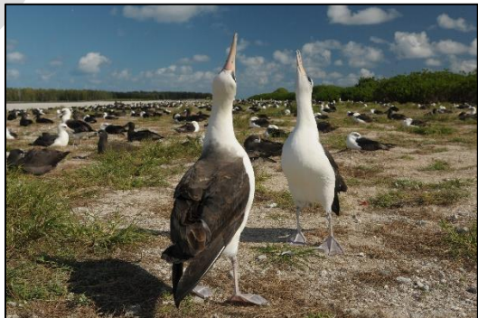
John Sidle; 2022 Photo Contest: Wildlife (non-captive)